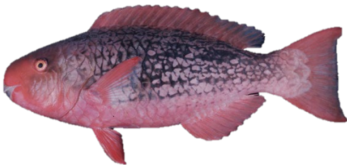
Uhu pālukaluka Scarus rubroviolaceus Redlip parrotfish (initial-phase)